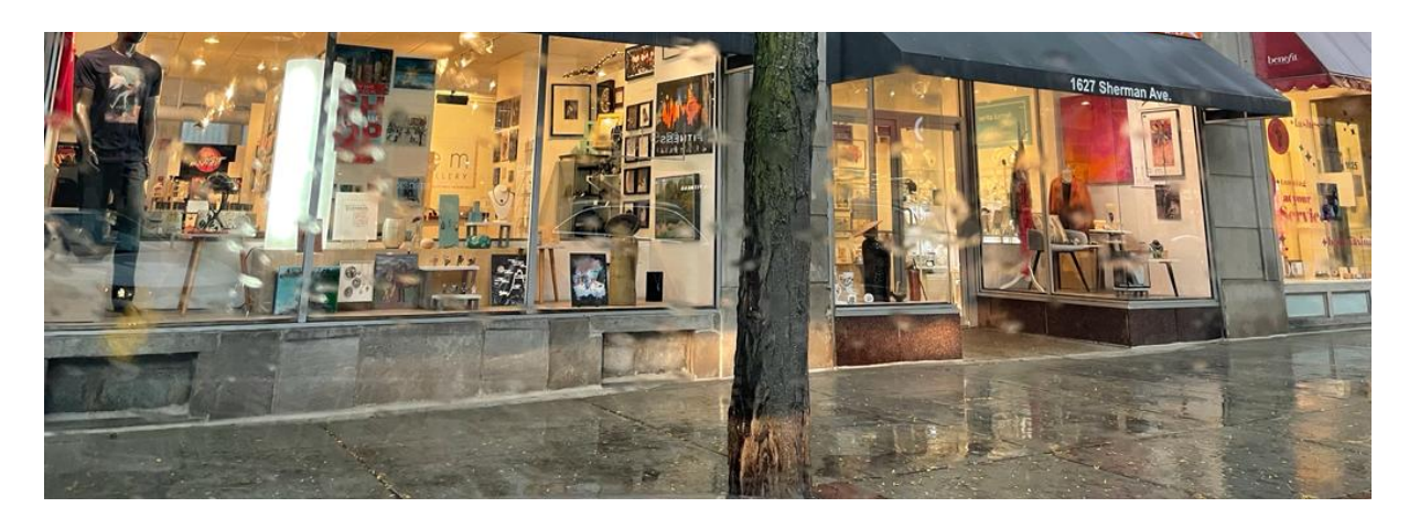
A glimpse into our gallery showing the work of 70+ talented artists.