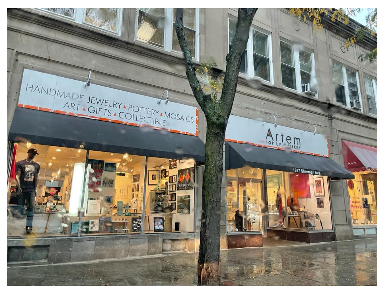
A glimpse into our gallery showing the work of 70+ talented artists.